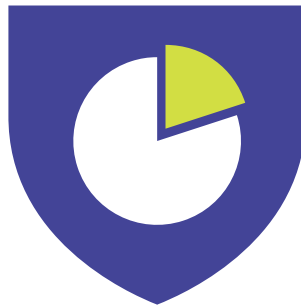
A percentage of your estate